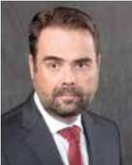
Registered Investment Advisor

We are committed to listening intently to understand your dreams, goals and values. We will provide a safe and comfortable environment to share your personal and financial details. This allows us to give you a second opinion on your current financial picture, help you to re-imagine your existing picture or even begin the process to build a new strategy.